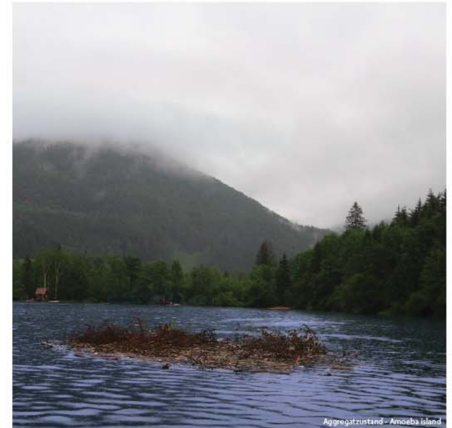
Aggregatzustand - Amoeba island