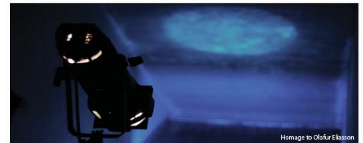
Homage to Olafur Eliasson